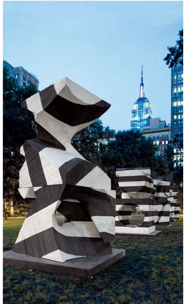
All photographs Markers , 2009 Cast concrete