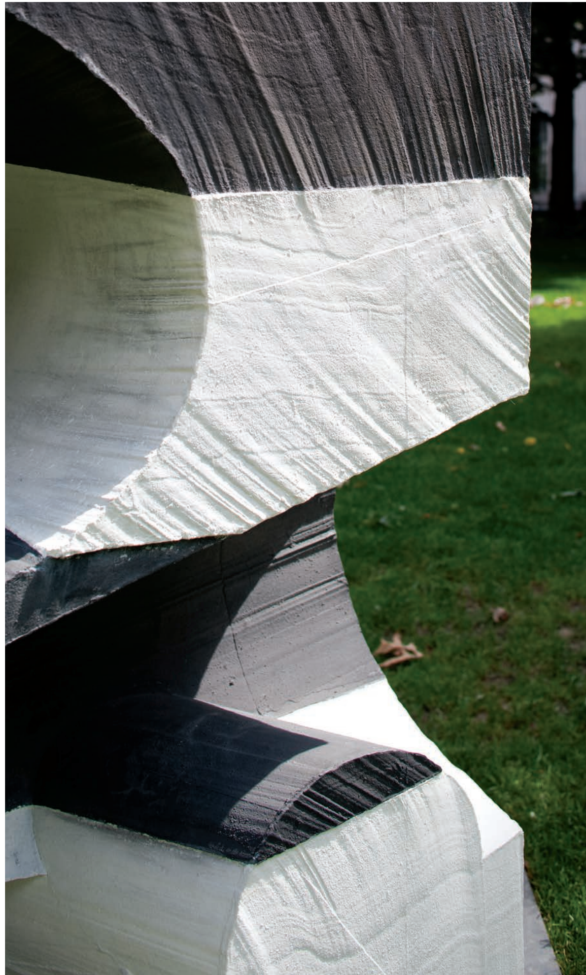
(Page 8) Markers V , in production