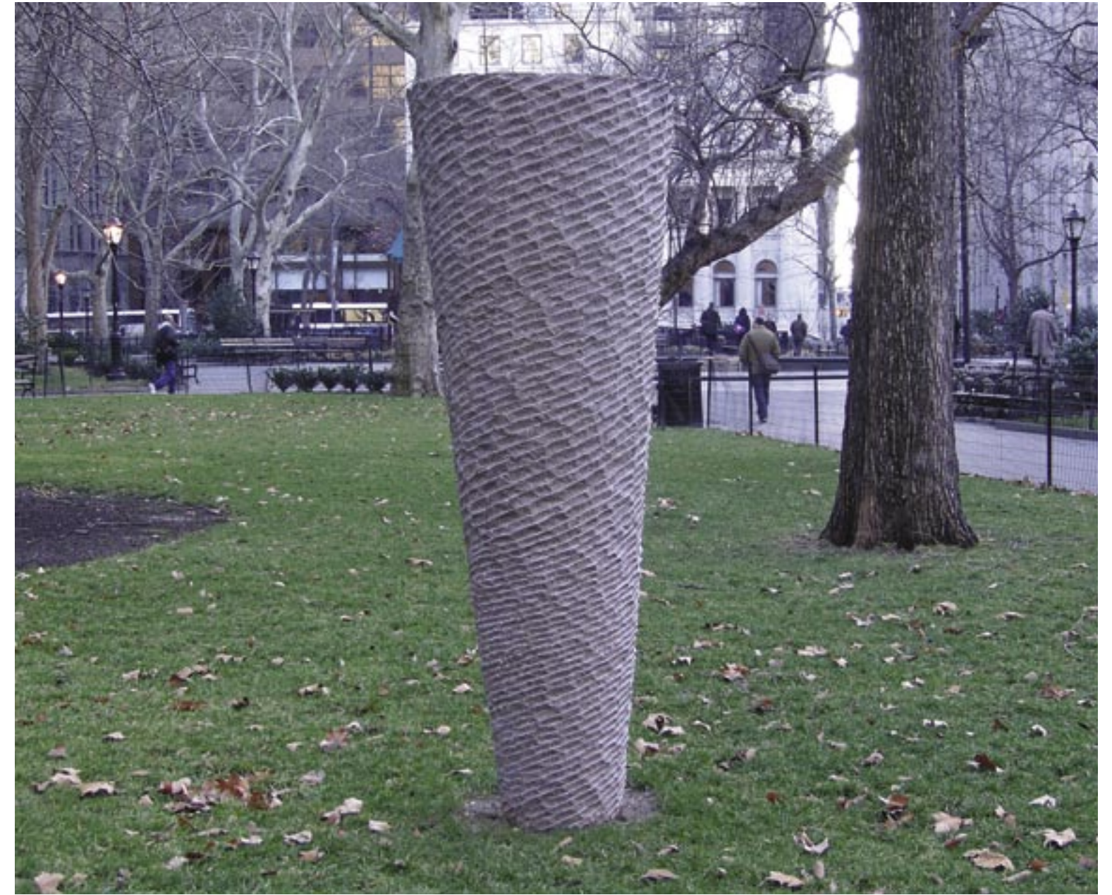
Tornado , 2004 Granite