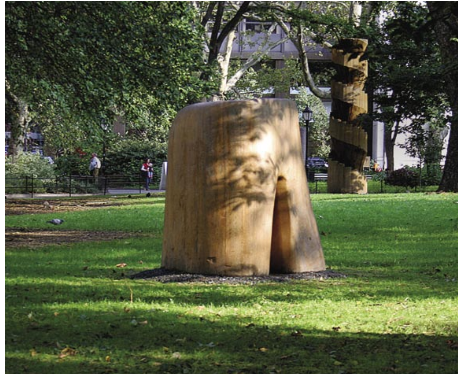
Female Figure , 1991 Western Red Cedar