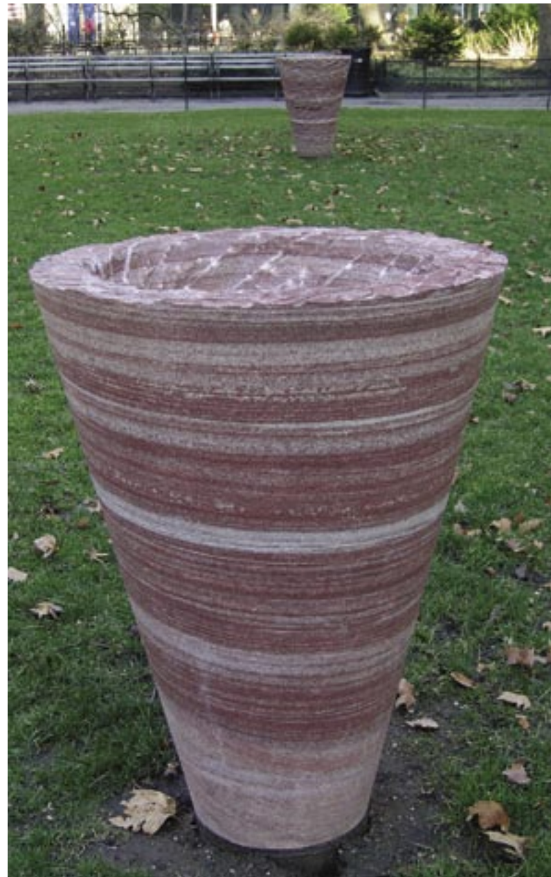
Foreground: One Meter Tornado (Internal) , 2004 Quartzite Background: One Meter Tornado (External) , 2004 Quartzite