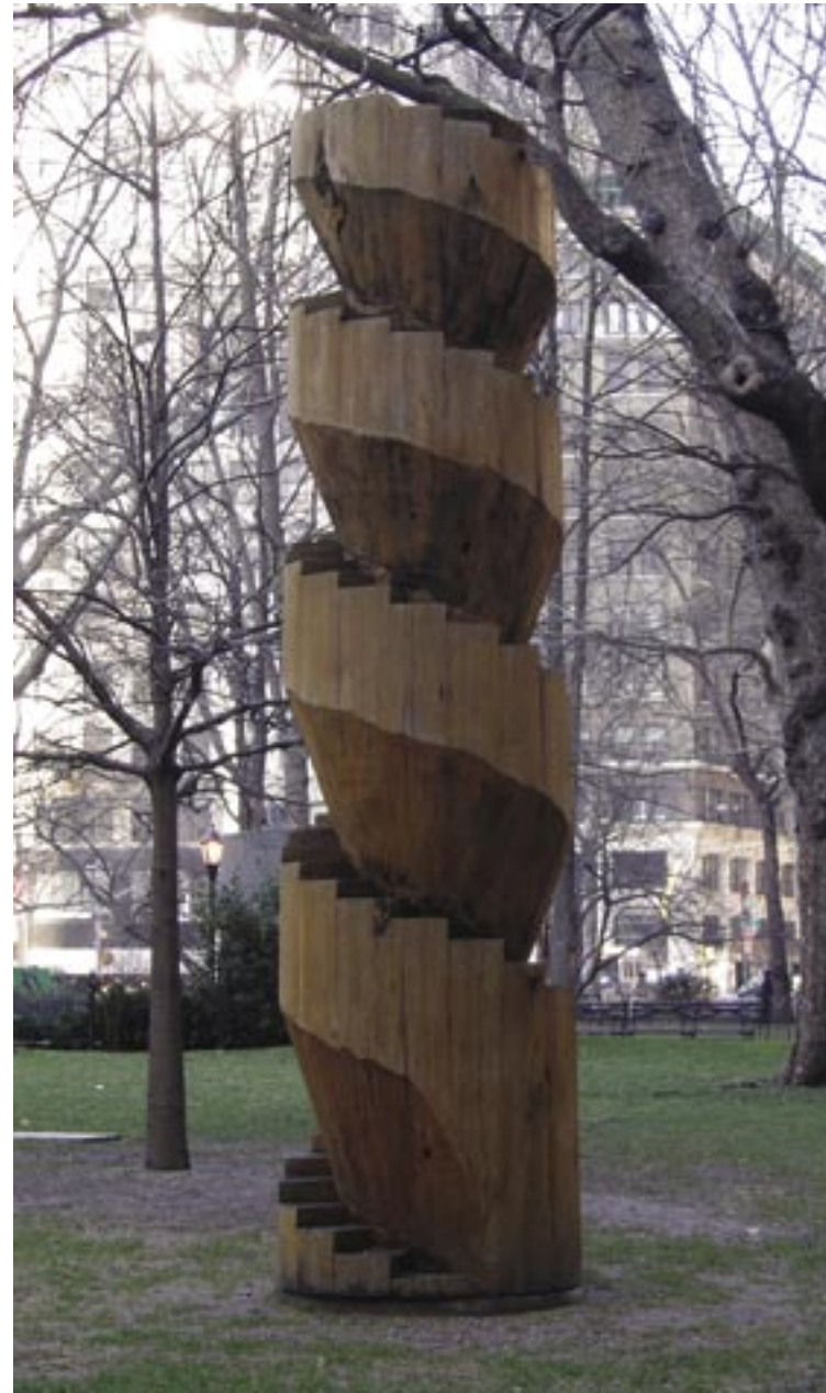
Cedar Staircase , 1999 Western Red Cedar

In the second room, on a nearby lawn, are two cedar pieces, a sculpture from 1999 made from Canadian red cedar hewn from an 800-year-old tree and a female figure from 1991, one view pure form, the other clearly a lower torso. Cedar Staircase has a warm, ruddy glow while Female Figure is paler, the surface rubbed, worn, a surrogate for flesh, gleaming gold in certain lights. Highstein has always preferred singular, monolithic forms as a way to define the sculpture and emphasize the physicality of the material. His intent is still formal and perceptual but also increasingly theatrical and architectural, the sculpture carefully integrated into the site and subject to the contingent relationships between object, space and viewer. Cedar Staircase , encircled by carved steps, is architectural but also linked to the body, a connection implicit in the gentle swelling of its 16-foot shaft that recalls a similar organic give in Greek Doric columns. The silken Female Figure is also essentially columnar but much more overtly representational, its interior a void, like the human body, its mass reduced to skin, to surface. Both sculptures are beautifully sited in accordance with the trees around them, which become a framing device, and incorporated into the installation.