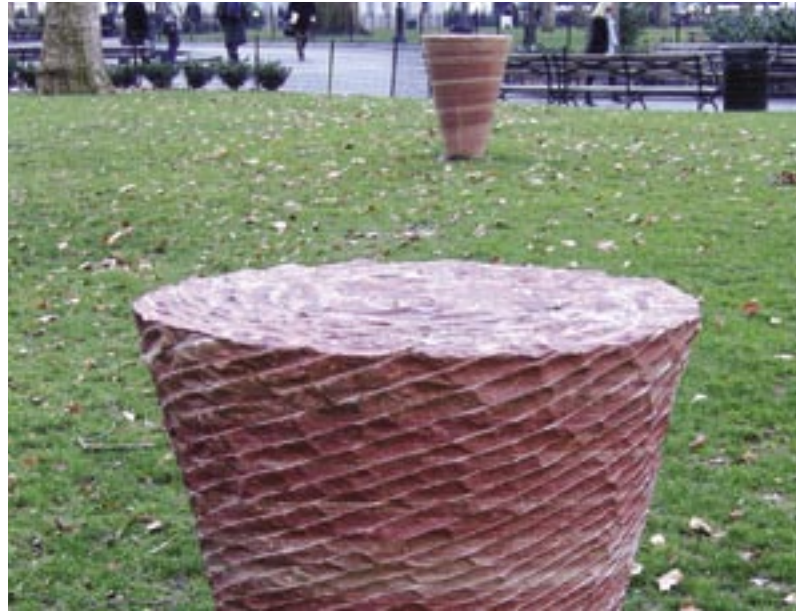
Foreground: One Meter Tornado (External) , 2004 Quartzite Background: One Meter Tornado (Internal) , 2004 Quartzite