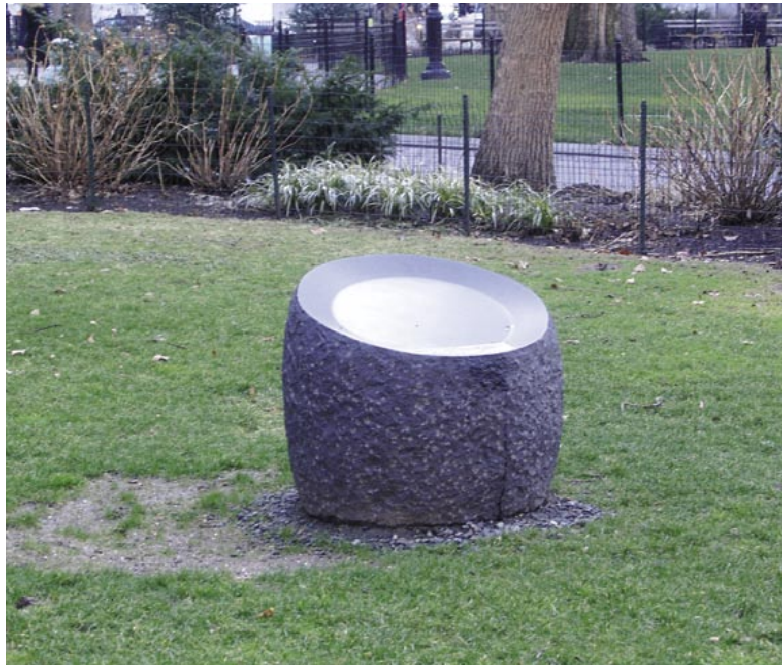
Below: Foreground: Dangerous Object (External) , 2004 Black Granite Background: Dangerous Object (Internal) , 2004 Black Granite