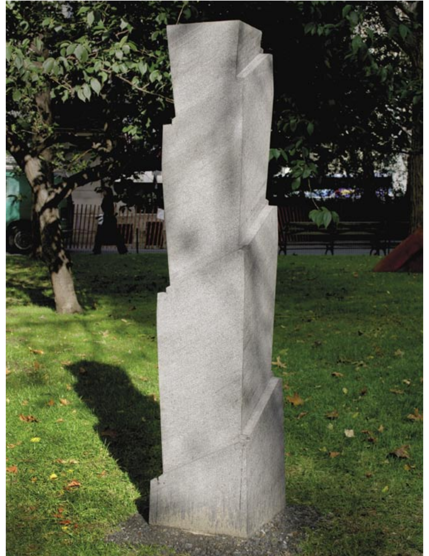
Right: Jacobean Staircase , 2001 Black Granite