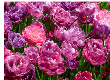
Tulip Beyond Baroque™ Blend