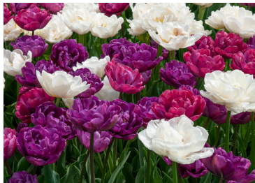
Tulip Diamond Touch™ Blend