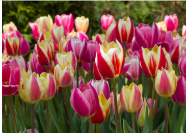
Tulip Skyliners™ Blend