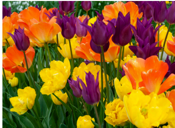
Tulip Vitamin See™ Blend