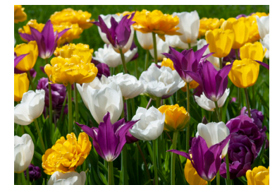
Tulip Bunny Hop™ Blend