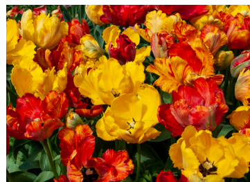
Tulip Tukano™ Blend