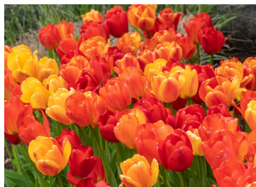
Tulip Vitamin See™ Blend