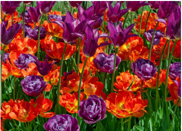
Tulip Merry Go Round™ Blend