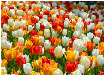
Tulip Chardonnay™ Blend