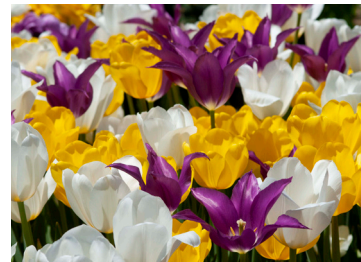
Tulip Cakewalk® Blend